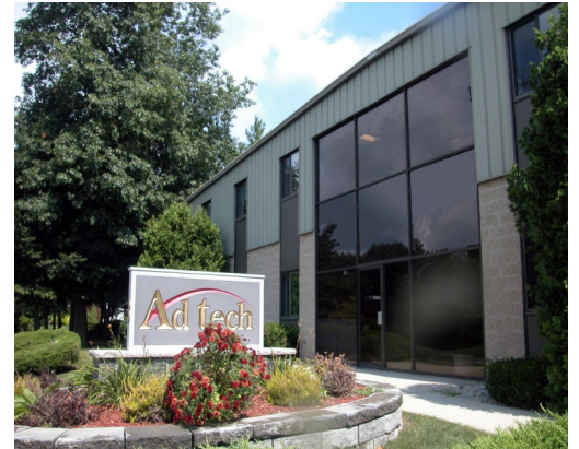
Ad tech World Headquarters Hampton, NH USA